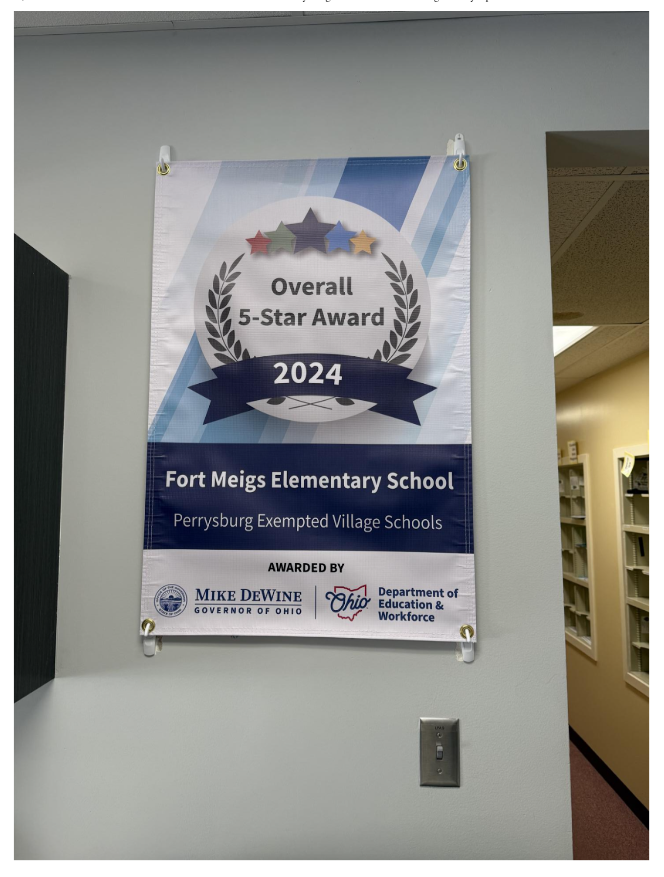
We are proud to announce Fort Meigs received a 5-Star Award from the Ohio Department of Education and Workforce!